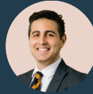
Van Senior Manager